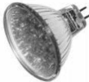
Figure 3: An example of the available retrofits for domestic and commercial use. An MR16 halogen lamp with white LEDs inside

Energy efficiency and the impact it will have on electrical networks, the directionality of the device in producing light, and light trespass and glare may now be tamed with LEDs. Its rural applicability is also high on the priority list for research. Sebitosi and Pillay (2003) succinctly illustrate how this high-