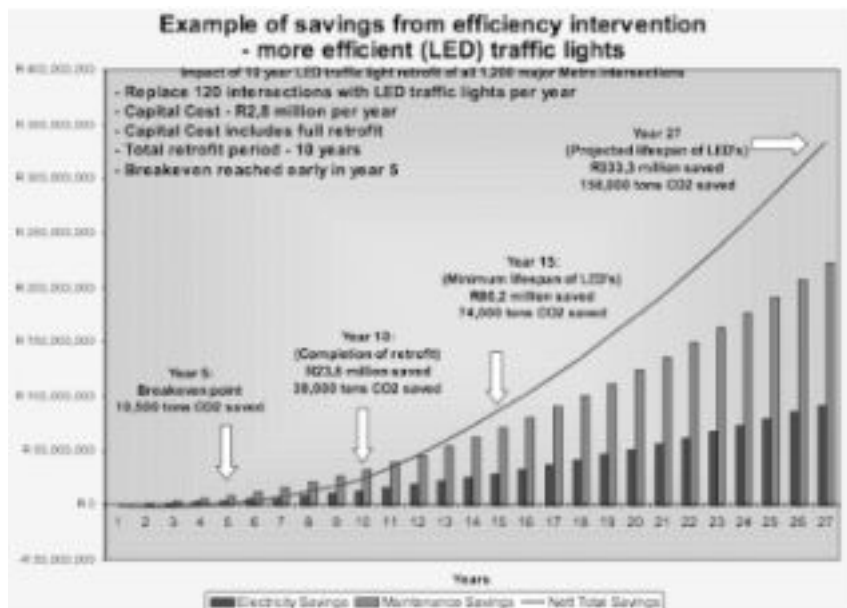
Figure 1: Projected cumulative savings of maintenance and electricity consumption over 27 years based on the use of the retrofitted LED traffic signals in Cape Town

(given that Cape Town alone has 100 000 incandescents in its traffic lights), it is the local authority's way of reducing its high consumption of electricity that accounts for 41% of its energy mix (City of Cape Town, 2006).