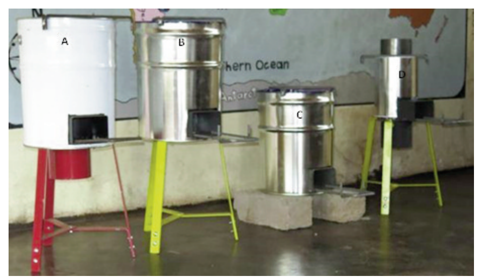
Figure 3: The Tshulu stoves: (A) Tshulu2 with ash remover; (B and C) RS1 and RS2 based on the Aprovecho designs; (D) the smaller design Tshulu1.