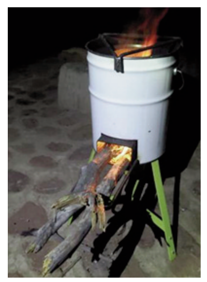
Figure 6: Tshulu stove with improved design principle.

tographs were taken of one of the interpreters working at the stove at sitting height and at standing height. These were then printed out and the participants were asked to blind vote on which height was most preferable. The blind vote revealed that 50% of the participants preferred cooking while standing and that 50% preferred cooking while seated.