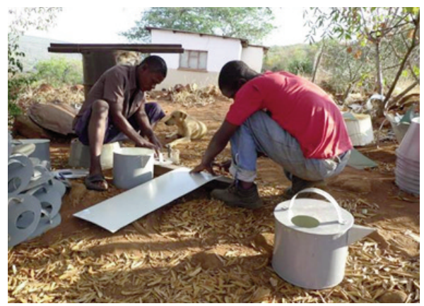
Figure 7: Local artisans manufacturing the 'Chichakuluma' kettle.

A portion of the investigation of the area was also to ascertain the potential of local artisans to be involved in the manufacturing process to make solutions locally. It was found that there are two skilled craftsmen in the HaMakuya village from Mozambique, who live in the area and manufacture the 'Chichakuluma' kettle (Figure 7), which is found in the majority of households in HaMakuya. The sheet metal used for making the kettles is purchased from Johannesburg and delivered to the village once a month. All components of the kettle are made using hand tools at the artisan's outdoor manufacturing site.