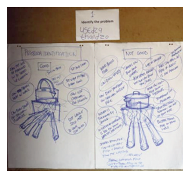
Figure 4: Drawings to discuss the merits and demerits of current cooking technologies.

cient in wood consumption. Again, there was a safety concern and an implication for health that they had experienced over time.