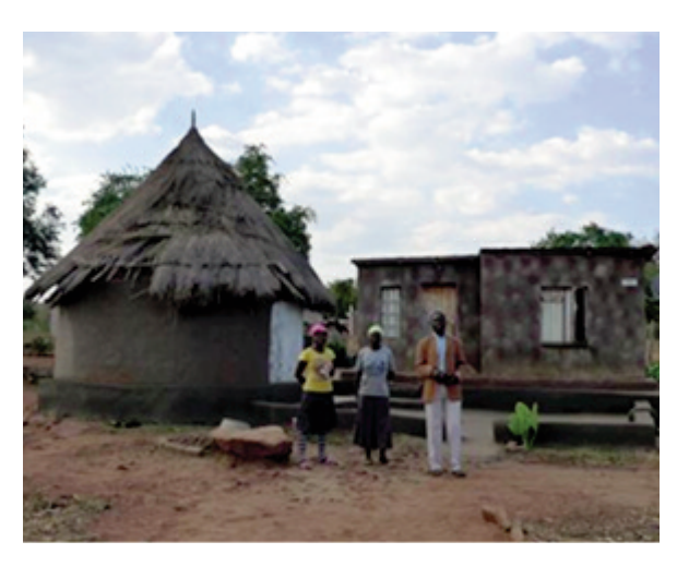
Figure 1: Typical household layout in HaMakuya village showing a detached thatched kitchen and an electrified brick house. (All photographs in this paper by Chris Bradnum)

In most African countries, including South Africa, a gap in knowledge exists in the areas of contextually relevant participatory design methodologies including co-design and co-creation processes. There is a need to understand people's needs to design and develop an ICS that can be socially and economically acceptable to the target communities. As such, there is an opportunity to contribute to the methods and approaches required to train non-designers to co-design and to co-create. Honkalaskar et al. (2013) argued that dissemina-